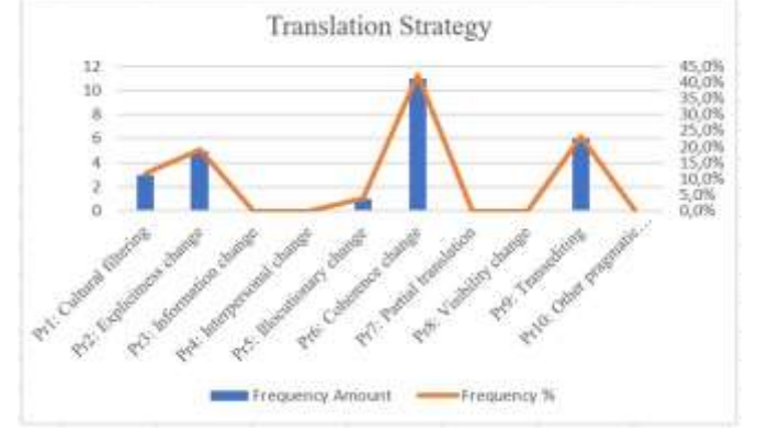
Figure 2. Percentage Translation Strategy Data Analysis